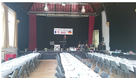
Welcome meal at the Town Hall